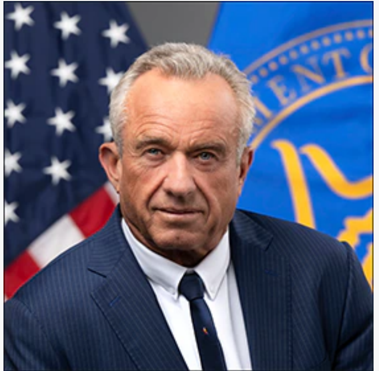
HHS Secretary Robert Kennedy Jr.