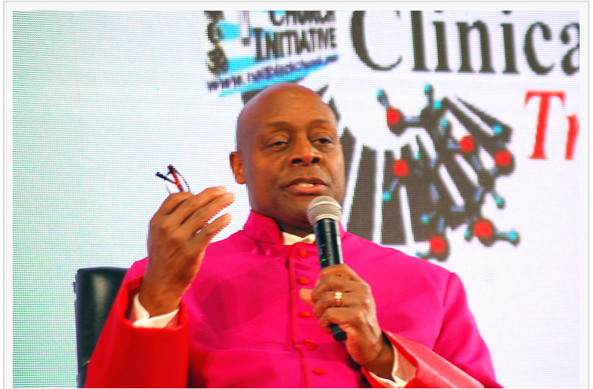
Rev Anthony Evans, President National Black Church Initiative

This press release can be viewed online at: https://www.einpresswire.com/article/911091745